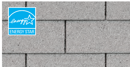
Star White XT 25 Star White is an ENERGY STAR® qualified product