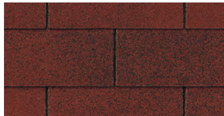
Tile Red Blend

NOTE: Due to limitations of printing reproduction, CertainTeed can not guarantee the identical match of the actual product color to the graphic representations throughout this publication