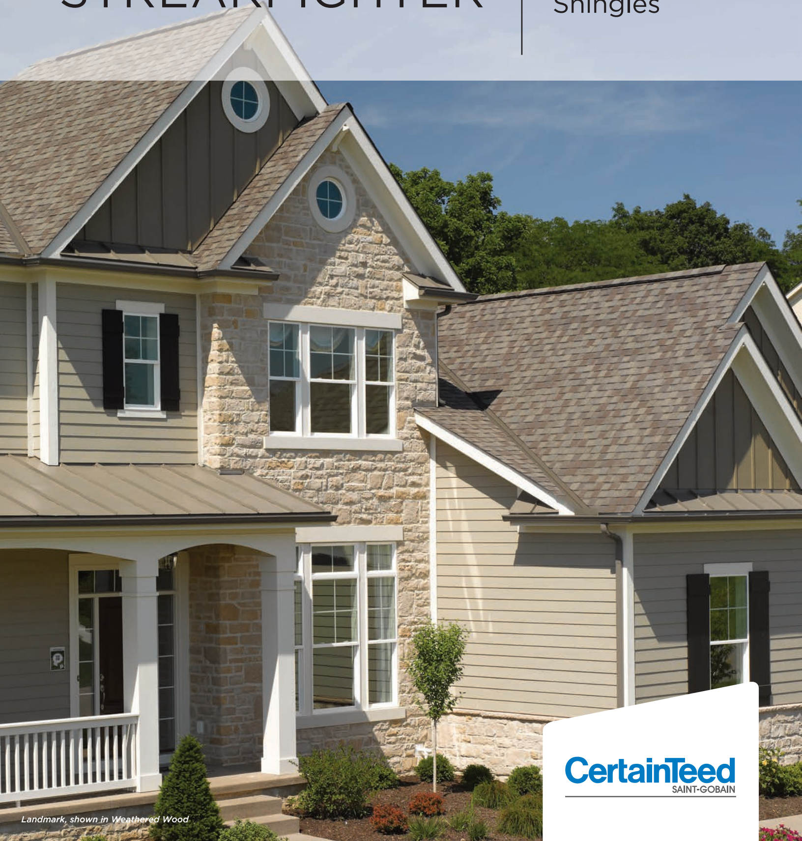
Landmark, shown in Weathered Wood